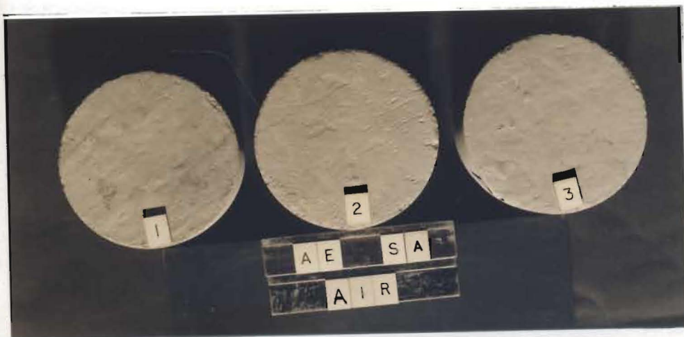
Specimens left in air