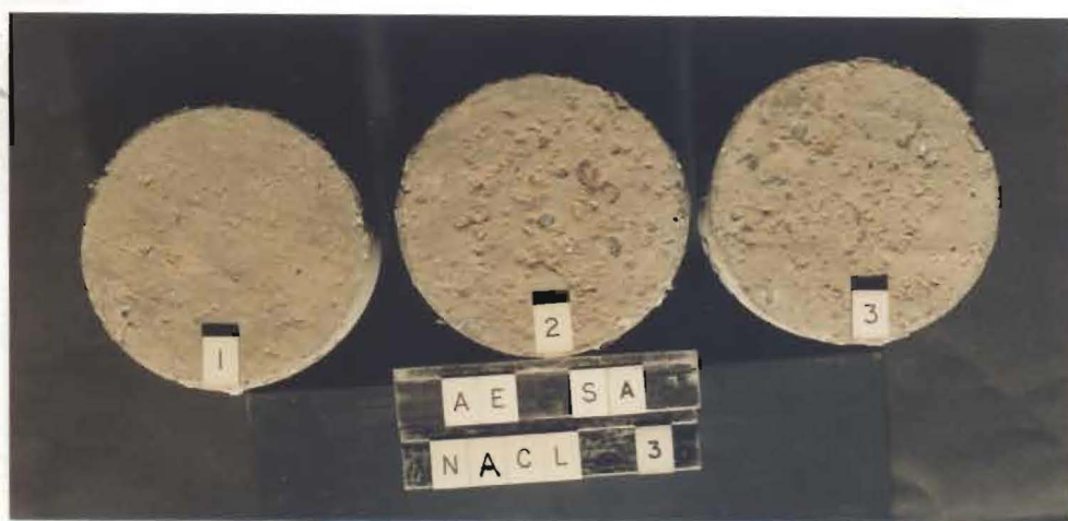
Sodium Chloride (3% solution) after 50 cycles